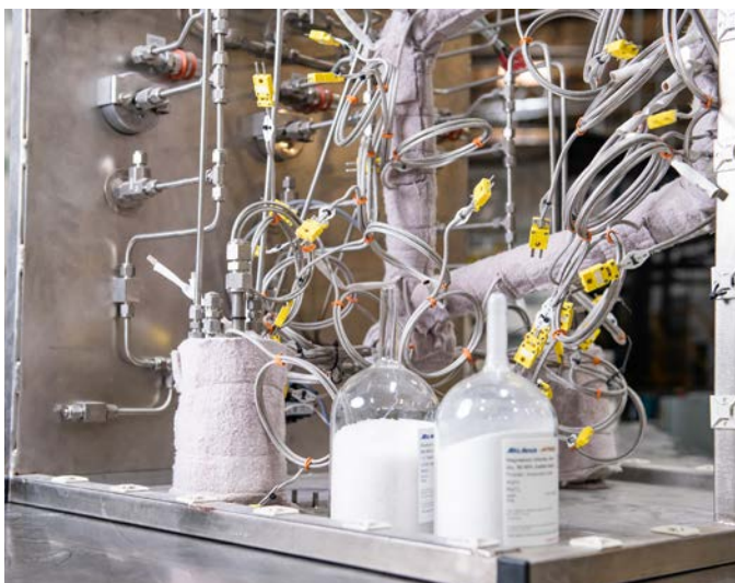
TerraPower rigorously tests molten salts through proprietary loops.

In December 2020, DOE selected the Molten Chloride Reactor Experiment (MCRE) proposal, with Southern Company as the prime, as a winner of the second Advanced Reactor Demonstration Program risk-reduction pathway. MCRE is relevant to TerraPower's MCFR design.