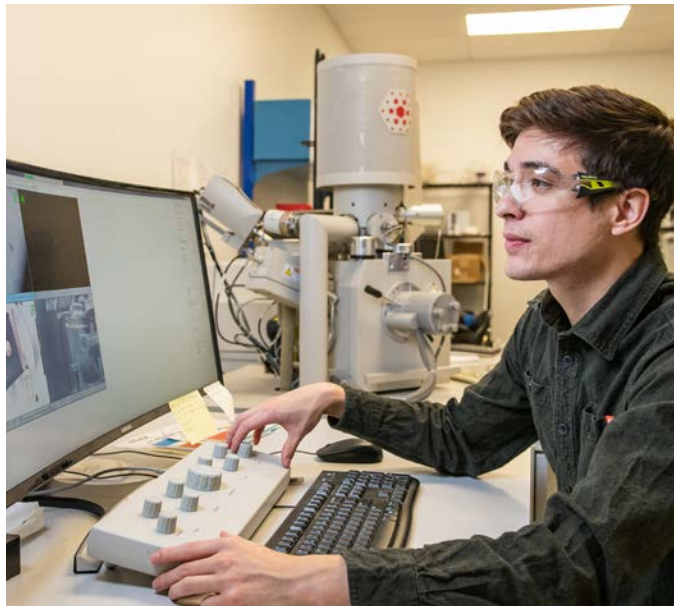
TerraPower's Everett laboratory allows for component testing as well as model validation.

TerraPower is a member company of the MSR Technology Working Group (TWG), which aims to accelerate the development and market deployment of MSR technologies. The MCFR program and collaboration through programs like the TWG will help determine licensing approaches, establish unique test facilities and result in the development of liquid-fueled reactors in the United States.