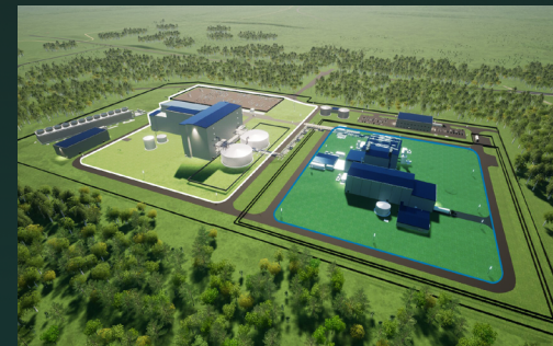
With the separation of major structures into a nuclear island and energy island, the Natrium plant requires less nuclear-grade safety equipment and is designed to utilize construction material quantities that are comparable to a combined cycle plant and significantly less than other reactor designs.

Offering multiple solutions to the needs of energy users and producers and designed to integrate with renewables , the Natrium system is cost-competitive with all other forms of clean energy generation with an operational lifespan of up to 80 years —paving the way for long-term, sustainable power generation.